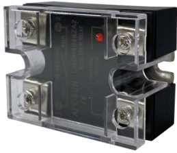
Product: Single Phase Solid State Relay