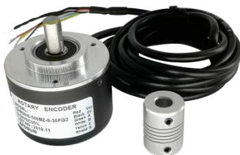
Product: Incremental Rotary Encoder

Feature: AC to DC SSR, AC to AC SSR, DC to AC SSR, DC to DC SSR. 3-32Vdc, 70-280Vac