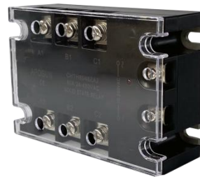
Product: Three Phase Solid State Switch

Feature: SSR, solid-state switch, 10/20/25/30/50/60/80/100/120A Load LED Indicator