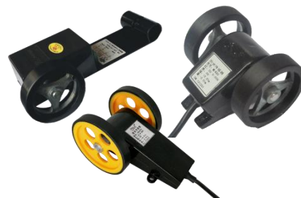
Product: Wheel Encoder Sensor ---Length Sensor

Feature: Diameter 38/50/58/70mm, Solid shaft 6/8/10mm, 100/200/500/1000/2000ppr.